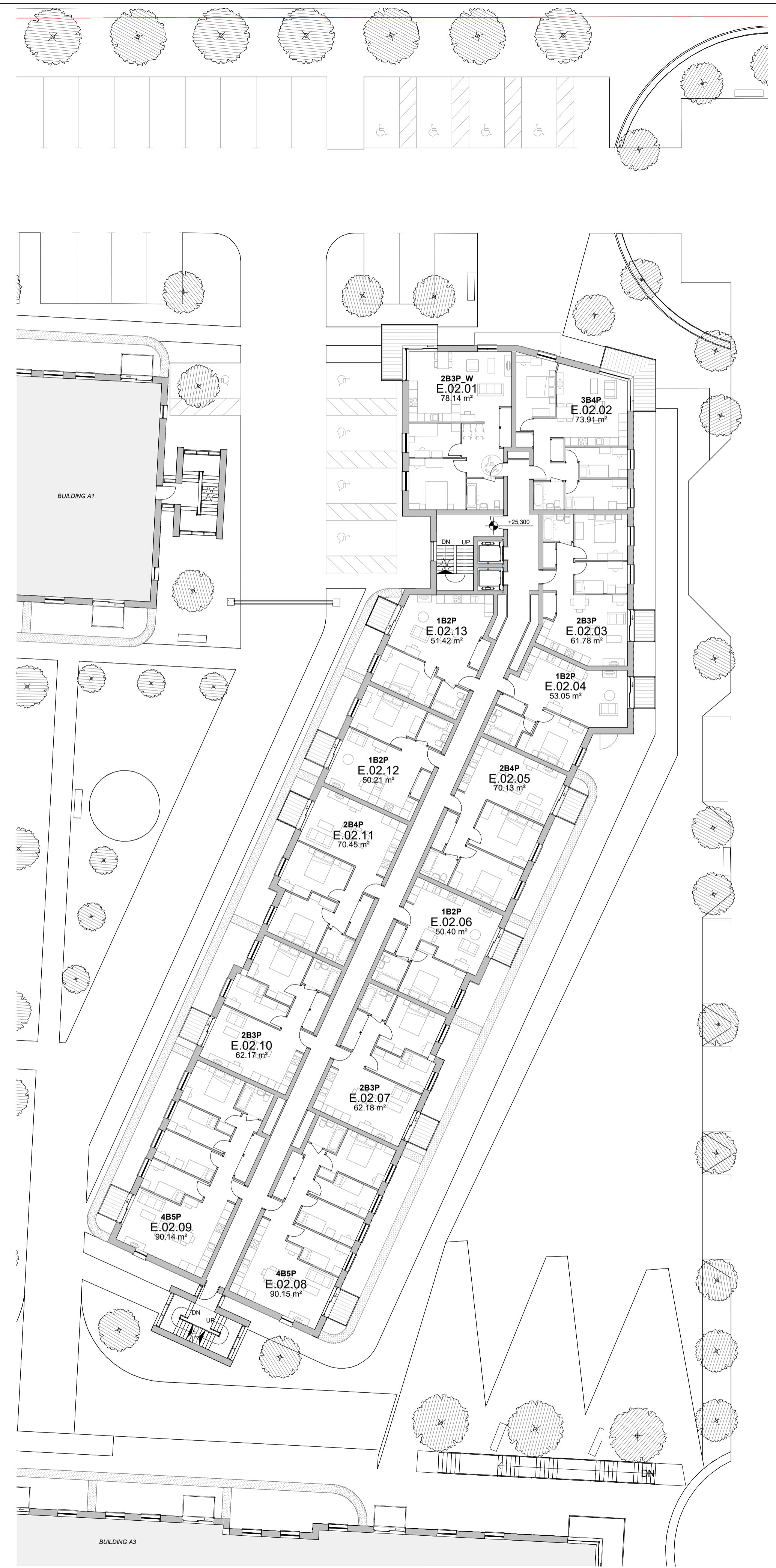
1 Level 2 +25.300 AOD 1:200